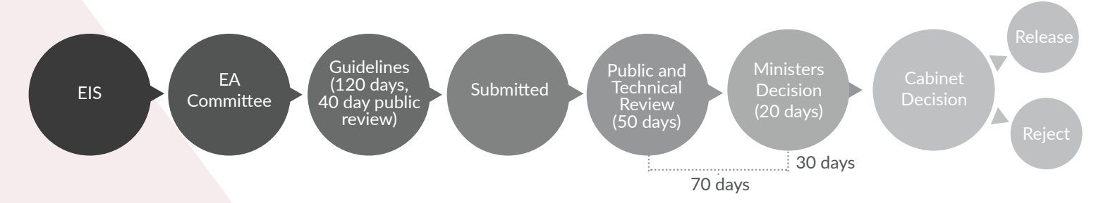
Figure 4. Steps in the Environmental Impact Statement of an environmental assessment.