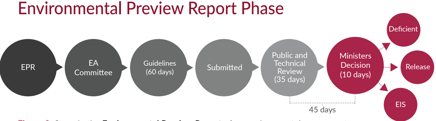
Figure 3. Steps in the Environmental Preview Report of an environmental assessment.